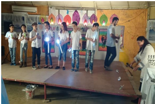
The Bar/Bat Mitzvah children of 2017 performing for the first time on Channukka