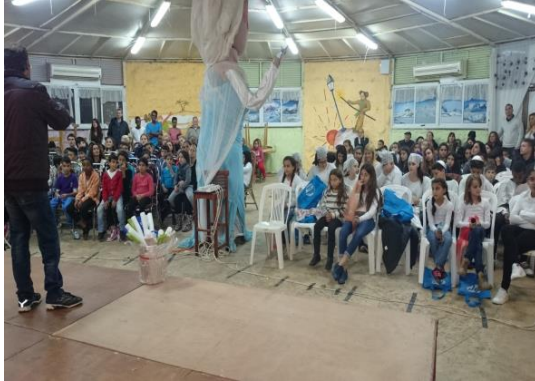
NEVE HANNA gathering for Channukka

Tel. 00972 – 8 – 688 80 19, Fax 00972 – 8 – 688 80 91 http://www.nevehanna.org dudu.weger@nevehanna.org